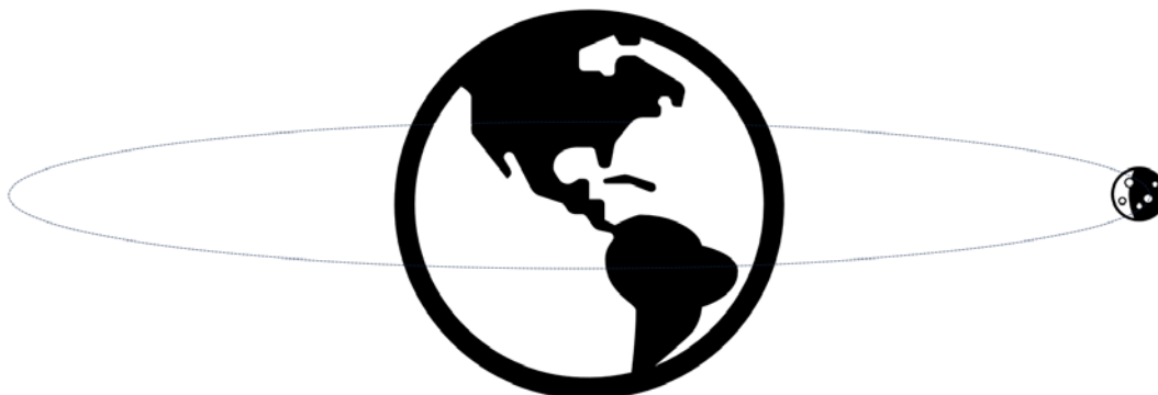
Image not to scale!