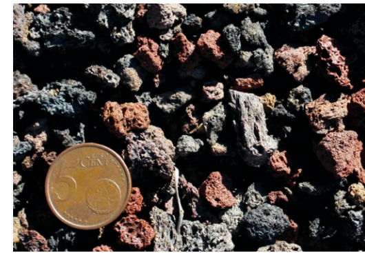
Scoria material on flank of Teide on Tenerife, Canary Islands, Spain